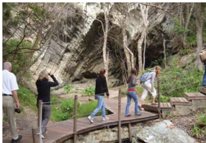
BOARDWALK IN THE TSITSIKAMMA FOREST