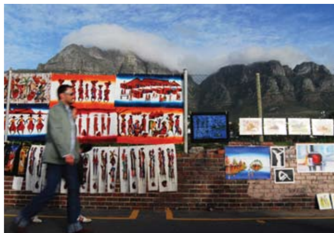
STREET ART IN CAMPS BAY