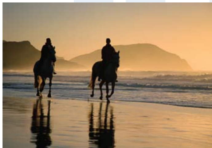
SUNSET HORSE RIDE ON NOORDHOEK BEACH