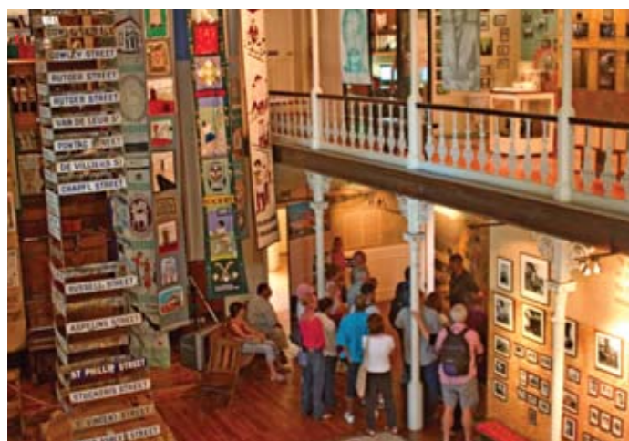
THE DISTRICT SIX MUSEUM