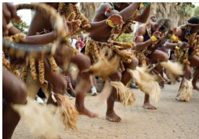
TRADITIONAL ZULU DANCERS