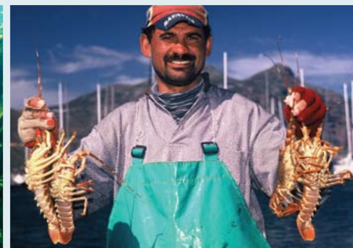
HOUT BAY LOBSTER FISHERMAN