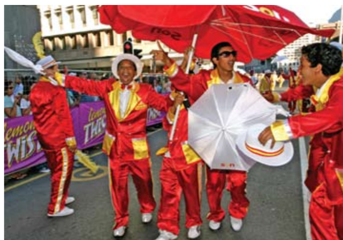
THE CAPE MINSTRAL CARNIVAL