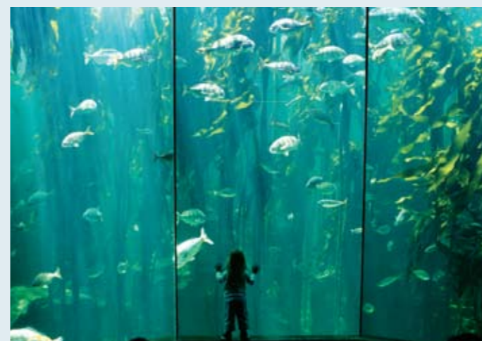
TWO OCEANS AQUARIUM

10 And and and ...so much to do and explore you won't know where to begin !!